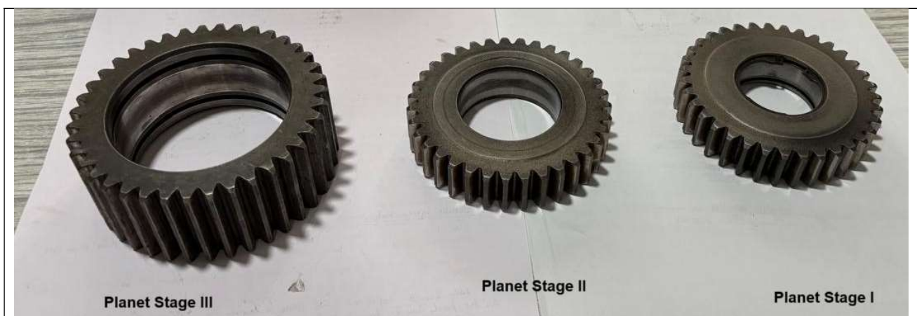
Planet Stage III